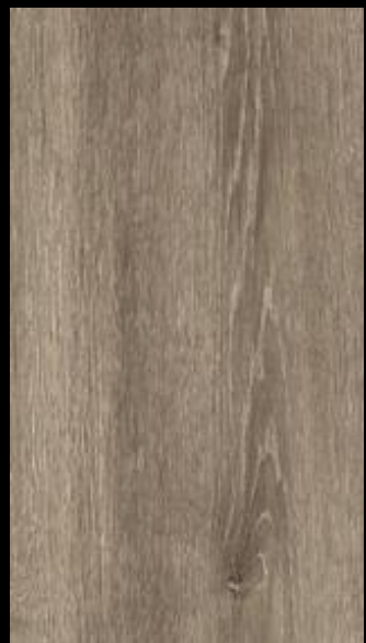
Swiss Oak Zurich