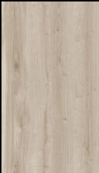
Torina Oak Candido