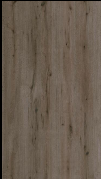
Riven Oak Beige