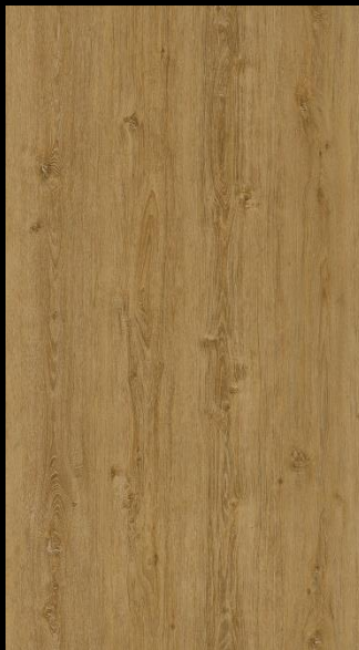
Natural Oak Medium