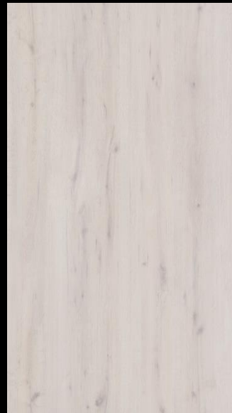
Riven Oak White