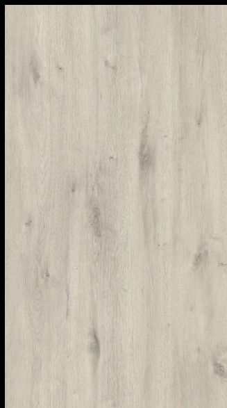
Swiss Oak Lucern