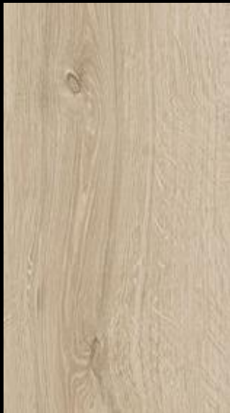
Torina Oak Lino